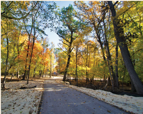
Investments in the park system this summer include continued construction of the Northwest Greenway.

A League of Women Voters-sponsored candidate forum is set for 7 p.m. Tuesday, Oct. 18 at City Hall, 3400 Plymouth Blvd. The public is invited. Video of the forum will be available on the Channel 12 website and replayed by Northwest Community Television on Channel 12. To watch or find replay times, check twelve.tv/politicalforums .