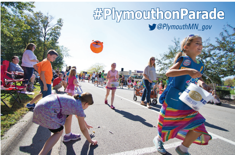
Tweet your parade pictures with #PlymouthonParade for a chance to be retweeted by the City of Plymouth on Twitter, @PlymouthMN_gov.

In addition, open swimming, gym and ice skating will be available at Life Time Fitness and the Plymouth Ice Center, next to the Hilde Performance Center. The Plymouth Concert Band will also perform.