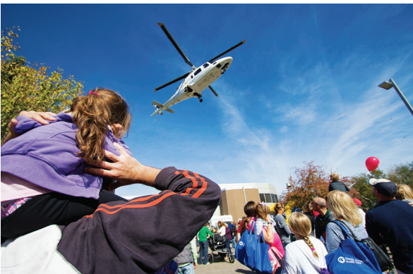
Open house events include games, inflatable bouncers, complimentary refreshments and a visit from the North Memorial helicopter (pictured above).