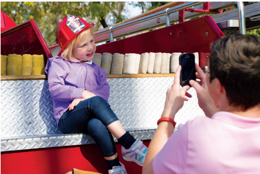
The Plymouth Fire Department will host its annual open house Saturday, Oct. 15 at Fire Station III. The free event allows residents to get a hands-on look at the fire service.

Firefighters and police officers will attempt to eat 12 of the hottest chicken wings in less than six minutes without a beverage, dipping sauces or napkins. The sauce is reputed to be 60 times hotter than jalapeño peppers.