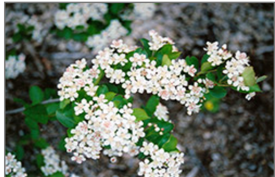
Aronia melanocarpa 'Autumn Magic' flowers