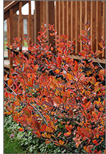
Aronia melanocarpa 'Autumn Magic' in fall

Autumn Magic Chokeberry is recommended for the following landscape applications;