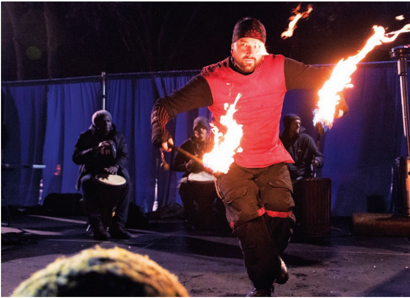
Fire dancers return to the stage for the 2017 Fire & Ice Festival in Plymouth. The event also features games, dog sled rides, s'mores, fireworks and more.

A $250 prize will be awarded to the first sleuth who finds the medallion. Only Plymouth residents are eligible to participate in the medallion hunt. For more information on the hunt, visit the city website.