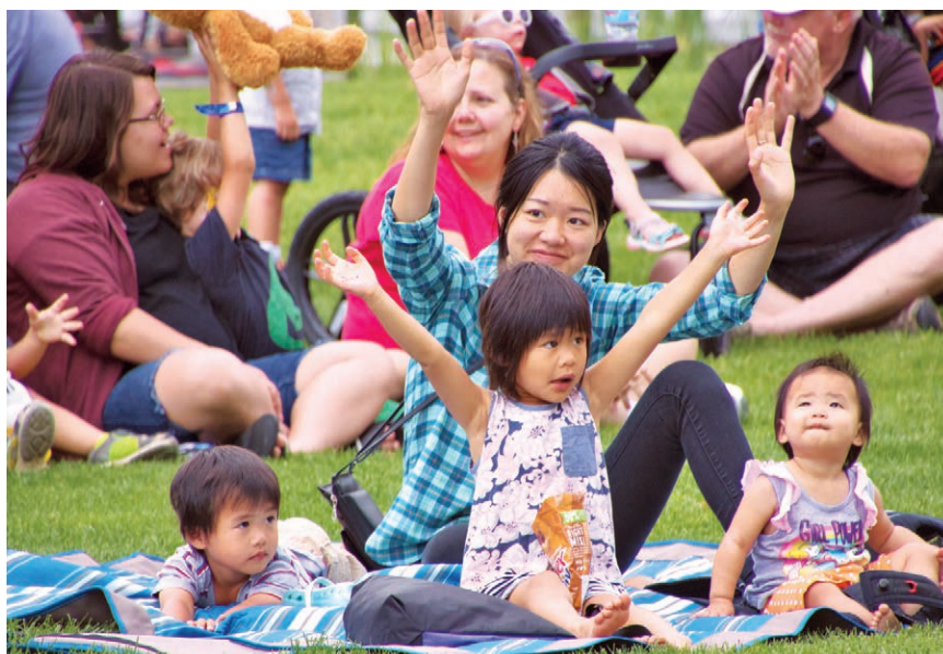
Residents who participate in Plymouth's variety of Parks and Recreation programs will notice a new online registration system. All users must create a new account.

When registering, be sure to add all family members to the account. Adding a family member after account finalization requires a telephone call with Parks and Recreation staff.