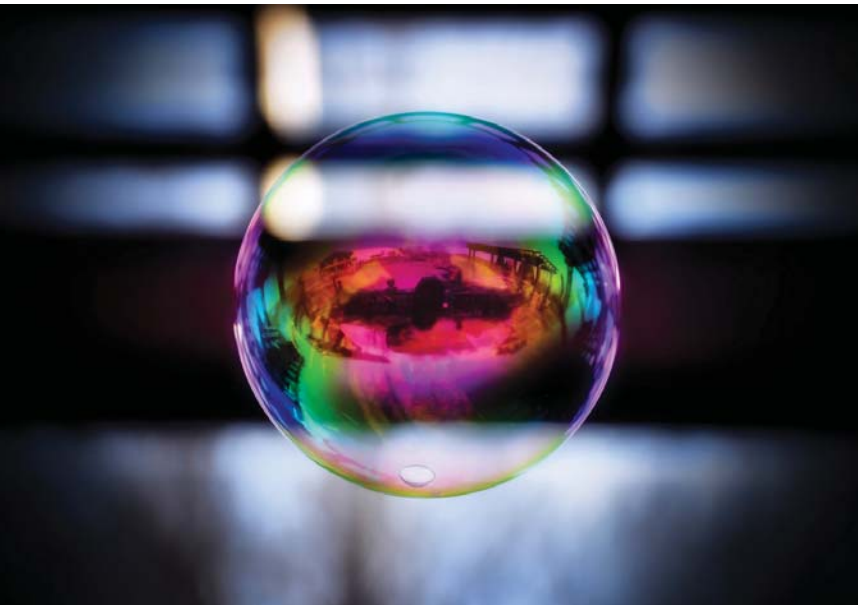
Activities and Events – "Millennium Garden in a Bubble" by Rachel Hall