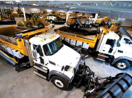
This year's City Sampler, set for Saturday, April 28, spotlights the newly expanded Plymouth Maintenance Facility.

The Plymouth Maintenance Facility underwent a major transformation through the first part of 2017. Now complete, the building is better suited to serve the needs of a growing community. The facility houses the city fleet and all equipment, vehicles and staff needed to maintain roads, parks, trails and the water, storm water and sanitary sewer system.