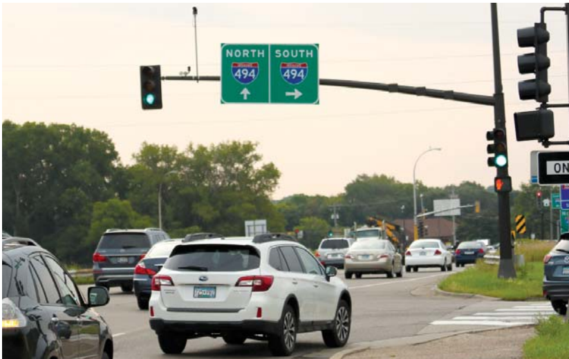
Plymouth continues to advocate for reconstruction of the County Road 9/I-494 interchange. The interchange lacks designated left turn lanes, which causes traffic to back up and poses safety issues. The bridge was built in 1965 and is visible deteriorating.

The interchange and bridge were built in 1965 and are visibly deteriorating. The city supports state bonding of more than $10.5 million to replace the increasingly outdated infrastructure.