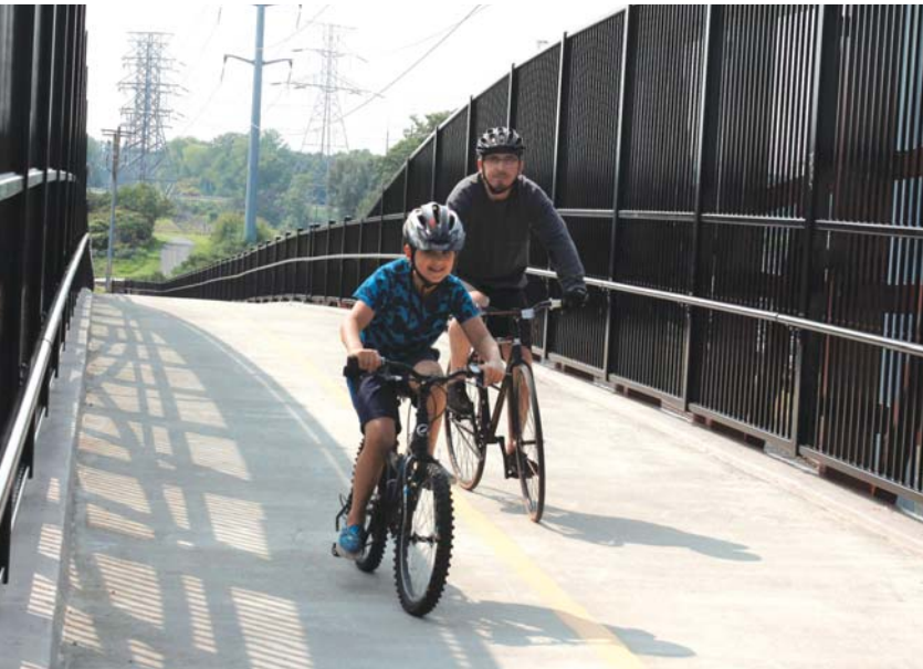
Readers' Choice – "Luce Line Bike Trail" by Jessica Antinozzi