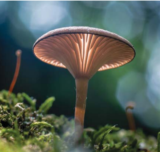
Wildlife and Nature – "Mushroom in French Park" by Riley Loew

Hundreds of entries were submitted to the 2017 Picture Plymouth Photo Contest. Categories included people and families, activities and events, wildlife and nature, city landmarks and pets. Keep the camera handy and start snapping for this year's contest. Entries are accepted Aug. 1-31. The contest is co-sponsored by the City of Plymouth and Plymouth Magazine.