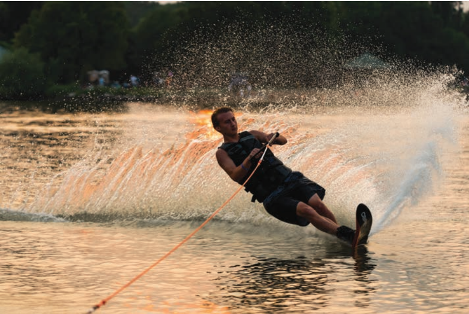
Readers' Choice/Activities and Events – "Evening Ski" by Shawn Christie