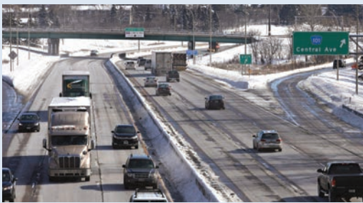
A project is set for the County Road 101 bridge.

automation packages and robotic accessories. Productivity is committed to helping companies implement innovative solutions to meet manufacturers' challenges. Headquartered in Plymouth, Productivity Inc. has had a presence in the city since the 1970s.