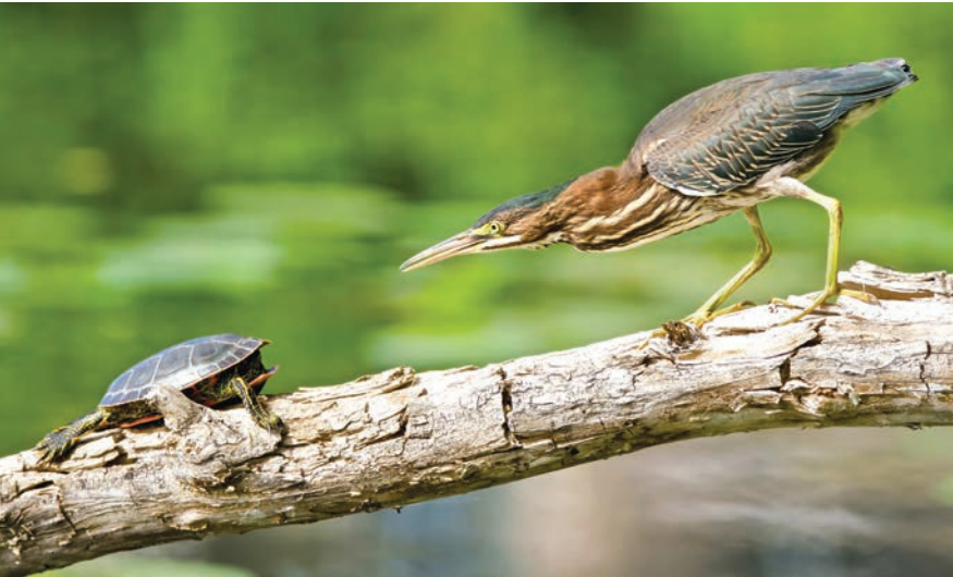
Best in Show – "Property Dispute" by Scott Mohn

Hundreds of entries were submitted to the 2018 Picture Plymouth Photo Contest. Categories included people and families, activities and events, wildlife and nature, city landmarks and pets. Keep the camera handy and start snapping for this year's contest. Entries are accepted Aug. 1-30. The contest is co-sponsored by the City of Plymouth and Plymouth Magazine.