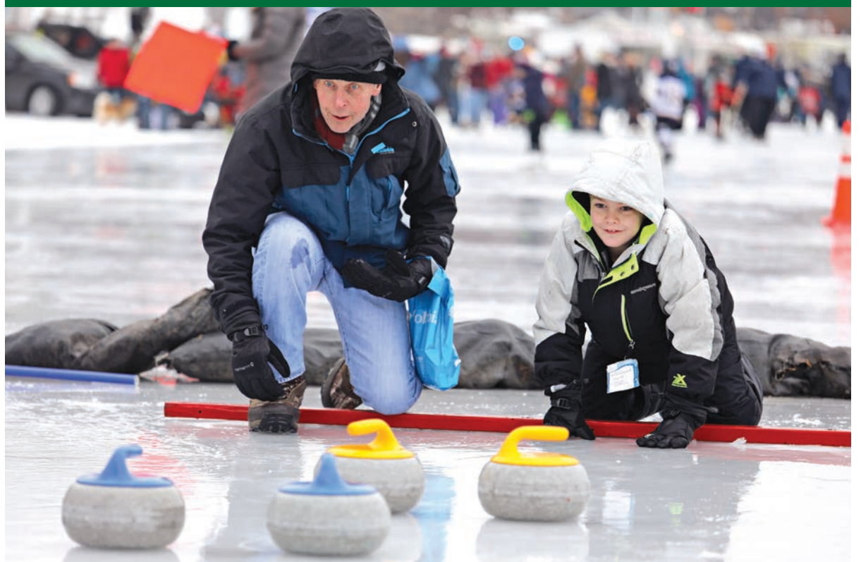
After a week of extremely cold temperatures, the weather gave Plymouth a break for the 30th annual Fire & Ice festival, where attendees could try their hands at curling, ride a dog sled, race in recycle bins and participate in a range of other winter activities.