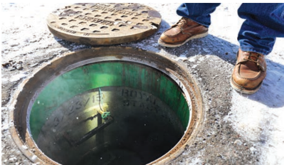
New manholes feature an inflow barrier (green ring).

The lining process is a fraction of the cost of replacing clay pipe. By 2021, Plymouth expects to have lined all small-diameter clay pipes within the city’s system.