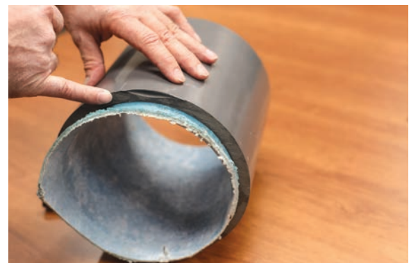
This piece of lined PVC pipe features the same lining Plymouth uses in clay pipes to combat water infiltration.

It can also increase the need for larger, more expensive sewer pipes and treatment facilities.