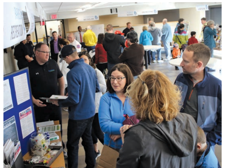
The annual City Sampler returns to the Plymouth Maintenance Facility this year. The event is set for 9-11 a.m. Saturday, April 27.

The City Sampler features the mayor, Plymouth City Council members and city staff who are available to answer questions about street maintenance, public safety, water quality, recreation activities and anything else residents are curious about.