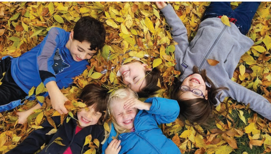
People and Families – "Fun in the Leaves"