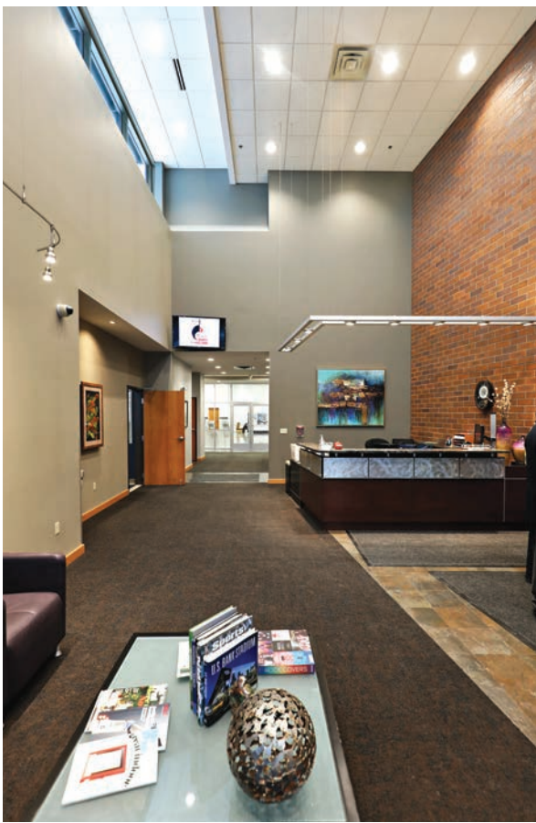
This year's State of the City will be held at Productivity Inc., which recently celebrated its 50th year in business.

Additionally, the company provides robotics and automation systems, including pre-engineered systems, custom robotic