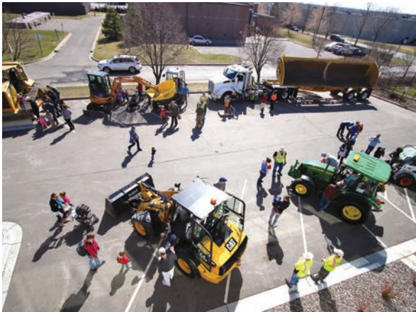
The annual City Sampler provides an opportunity for residents to get an inside look at what it takes to provide city services. Residents can come and explore the machinery, trucks and earth-movers that the city uses in its regular maintenance work in the city.

The Plymouth Maintenance facility houses all equipment, vehicles and staff needed to maintain roads, parks, trails, and the water, storm water and sanitary sewer systems, as well as the city fleet.