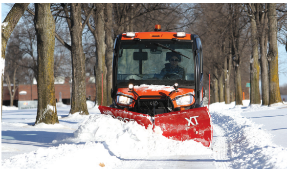
The Parks and Forestry Division cleared about 115 miles of city trail during each snow event.