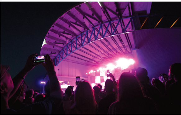
Live at the Hilde returns to Plymouth Saturday, Aug. 17.

The all-ages concert is presented by independent concert promotions company Sue McLean & Associates. Tickets and more information – including opening act announcements – will be available at suemclean.com/hilde.