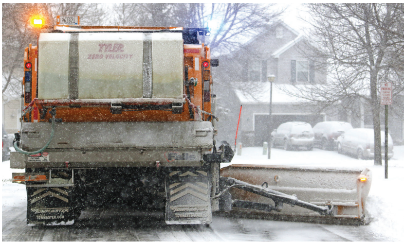
Plymouth Public Works crews worked overtime this season to keep roadways clear.

The city also added two more main plow routes, which are continuously cleared throughout a snow event. According