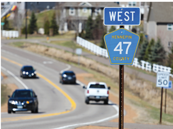
County Road 47 in northern Plymouth is being studied to determine future traffic and pedestrian management.

Residents also had an opportunity to provide feedback via an interactive map on the city website. Users marked areas along the map where they have had positive or negative experiences as pedestrians, motorists or bicyclists. For more information, visit plymouthmn.gov/CoRd47 .