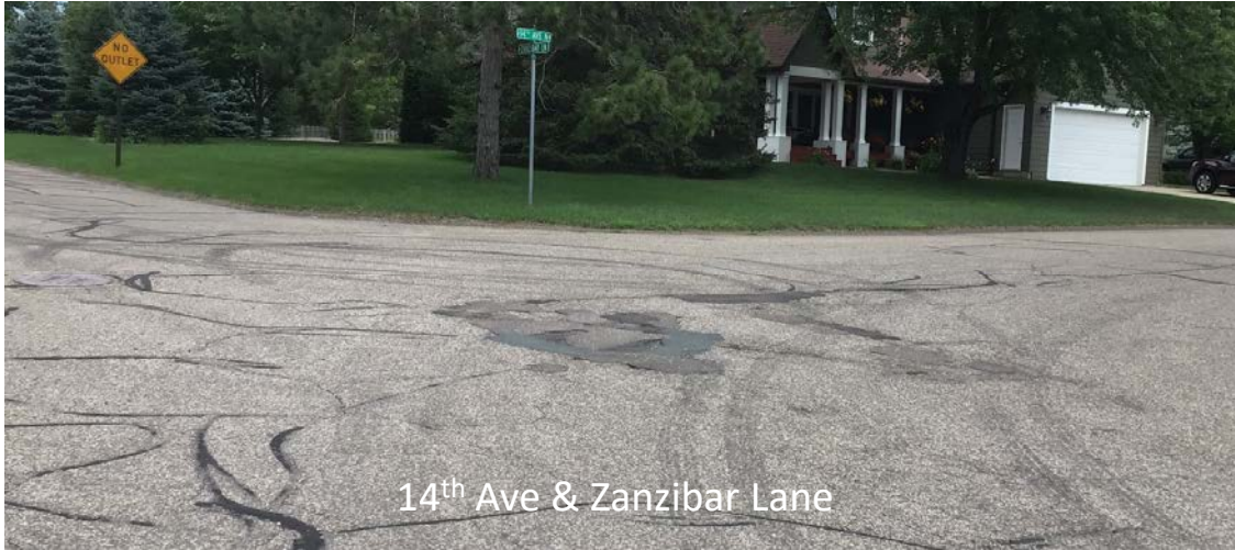
14 th Ave & Zanzibar Lane