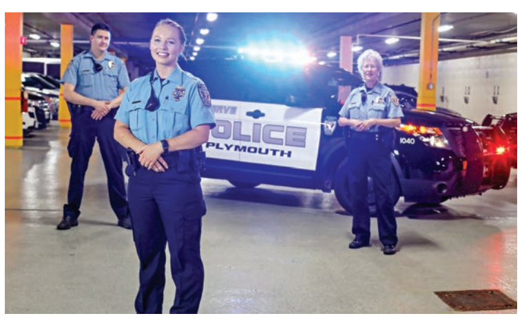
With programs such as the Plymouth Police Reserves (pictured) and the Plymouth Police Explorers, the Plymouth Police Department offers opportunities for those interested in learning more about public safety in Plymouth.

To become a reserve officer, applicants must be age 21 or older, pass a background check, provide 15 hours of service per month and attend one monthly meeting (counted toward volunteer hours). Plymouth Police Reserves come from all walks of life and have diverse cultural and professional backgrounds. All interested candidates are encouraged to apply for the volunteer position. For more information and to apply, visit plymouthmn.gov/reserves.