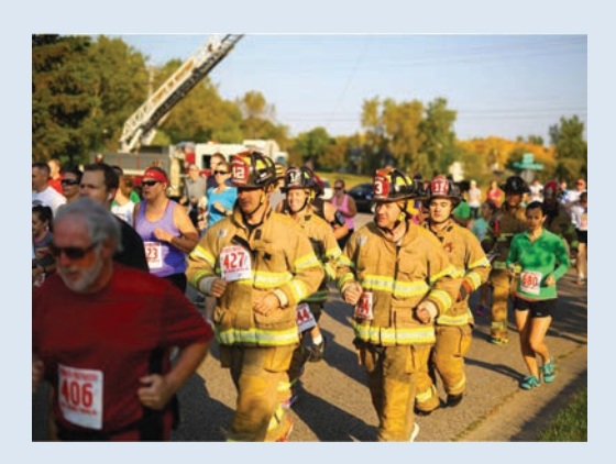
Formerly a Firefighters 5K, the new event combines the Police and Fire departments for the Plymouth Public Safety 5K on Saturday, Aug. 28.

Applications to join the Plymouth Police Explorers are available at plymouthmn.gov/explorers and at the Plymouth Public Safety Building, 3400 Plymouth Blvd. To have an application mailed, email volunteer@plymouthmn.gov.