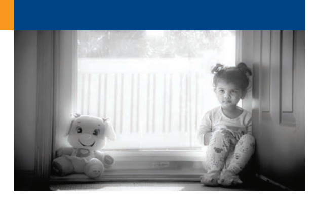
Last year's Picture Plymouth Photo Contest Overall Winner was "Social Distancing" by Bodhisatya Bhaduri.