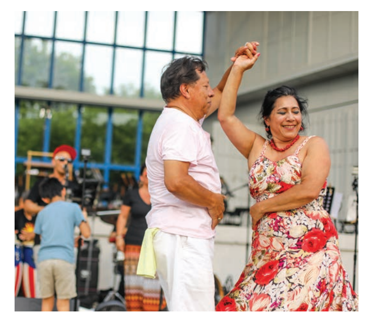
This year's Music in Plymouth features live music from Heart and Soul Drum Academy, Medicine Show Music Company, Malamanya, Ragamala Dance Company and Uptown Brass.

Those attending Music in Plymouth will not be allowed to leave blankets, chairs or tarps on the grounds until after 7 a.m. the morning of the event.