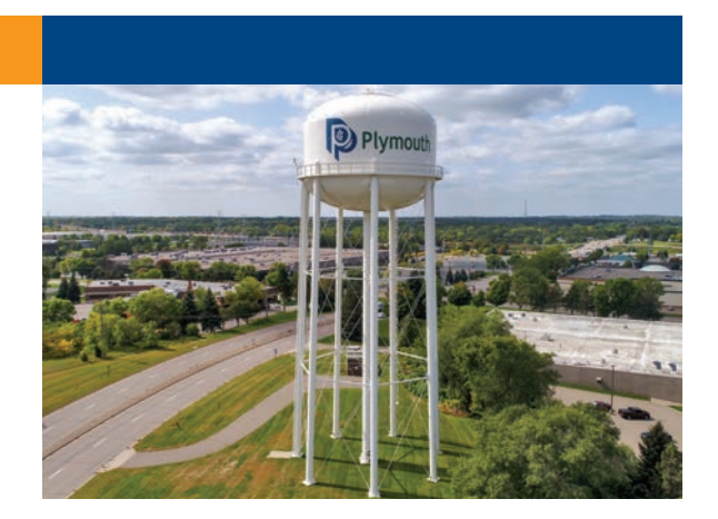
Photo categories include people and families, community activities and events, pets, wildlife and nature, and city landmarks. Top picks in each category will receive $50. A grand-prize winner will also be selected and receive $100. After the contest closes, visit plymouthmag.com to make a pick for the Readers' Choice winner. For complete contest rules, visit plymouthmag.com after Aug. 1.

Compose, focus and click – capture the moment and submit it to the annual Picture Plymouth Photo Contest. Photographers of all levels are asked to enter their best shots beginning Sunday, Aug. 1. Top photos of the year receive prizes and have a chance to be published in Plymouth Magazine, which co-sponsors the contest with the City of Plymouth. All entries must be submitted via plymouthmag.com from Aug. 1-31. Each entrant must live, work or attend school in Plymouth and photos must be taken in Plymouth from Sept. 1, 2020 to Aug. 31, 2021.