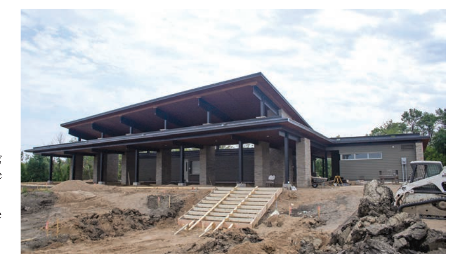
The trailhead under construction at the Northwest Greenway includes a pavilion, a multi-use plaza and more located at 5250 Peony Lane N.

For all projects below, please note that dates are weather dependent and timelines may be subject to change.