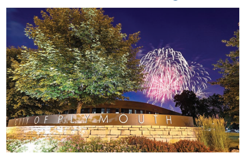
Originally scheduled as a virtual live-stream, Music in Plymouth returns as an in-person event Wednesday, July 7 at the Hilde Performance Center, 3500 Plymouth Blvd.