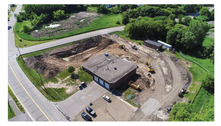
Plymouth Fire Stations 2 (pictured) and 3 are currently undergoing major projects to better accommodate Fire Department operations.

Owned and managed by the HRA, the rental units will be available to veterans and their families who meet