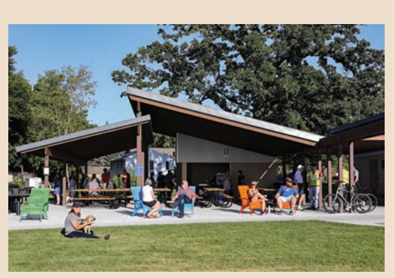
Summer Beach Series: Beaches, Burgers & Bands – Enjoy an evening of live music, food trucks and more on the beach 7 p.m. Friday, Aug. 13, East Medicine Lake Park, 1740 East Medicine Lake Blvd.

The 2021 movie sponsors include Kyle Vitense State Farm and TCF Bank. Attendees are reminded that curfew laws still apply. In case of inclement weather, movie showings will be canceled. Call the weather hotline at 763-509-5205.