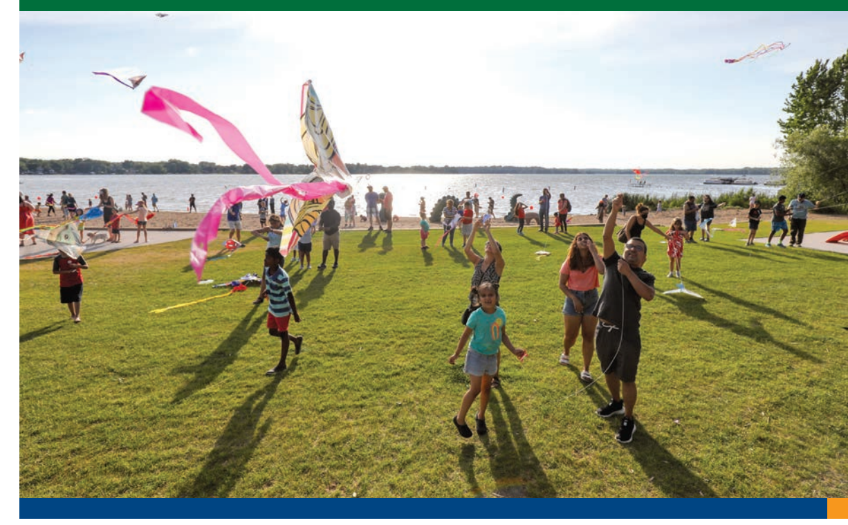
Plymouth hosted Kites Over the Beach in June. Hundreds came out to East Medicine Lake Beach to fly kites and learn about water safety from the Parks and Recreation Department. The event was the first of Plymouth's new Summer Beach Series, which also includes a water ski show on July 13 and Beaches, Burgers & Bands on Aug. 13. Learn more on page 5 and at plymouthmn.gov.