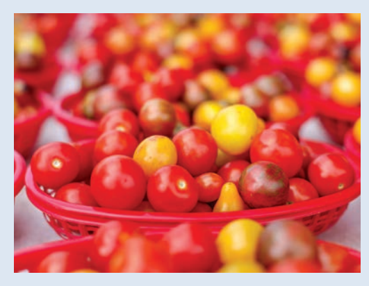
The annual outdoor Plymouth Farmers Market is held each Wednesday at Parkers Lake Park through Oct. 6.

Event details may be subject to change, for the most current information and a calendar of events, visit plymouthmn.gov/specialevents.