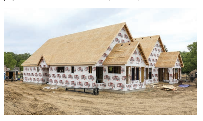
In April, construction began at Valor Place, a twin home for veterans located at Rockford Road and Fernbrook Lane in Plymouth.

income limits and other eligibility requirements. To make Valor Place possible, the HRA partnered with several organizations, including Charles Cudd Co., Outreach Development Corporation, Hennepin County, Plymouth Beyond the Yellow Ribbon and the Minnesota Assistance Council for Veterans.