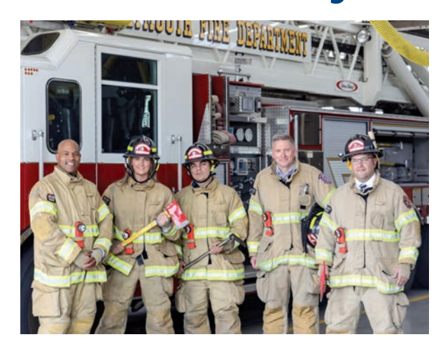
The Plymouth Fire Department is now accepting applications for part-time/on-call firefighters.