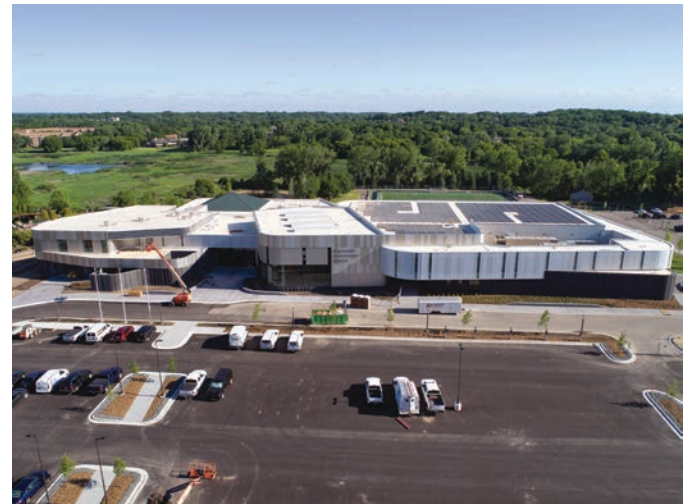
The Plymouth Community Center Event and Education wings are set to open Monday, July 18, marking the completion of the two-year project.