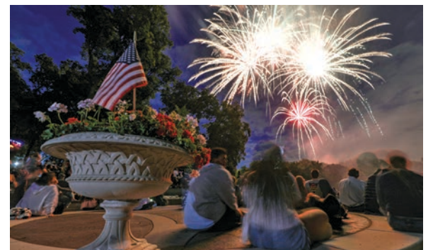
Music in Plymouth returns to the Hilde Wednesday, July 6.

Please note that, due to extensive underground wiring and sprinkling systems at the Hilde, staking and roping off seating areas is strictly prohibited. Those attending Music in Plymouth will not be allowed to leave blankets, chairs or tarps on the grounds until after 7 a.m. the morning of the event.