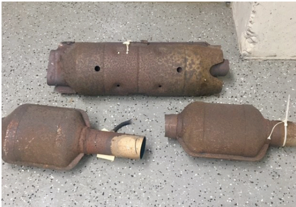
The Plymouth Police Department provides tips for residents to help prevent catalytic converter thefts.