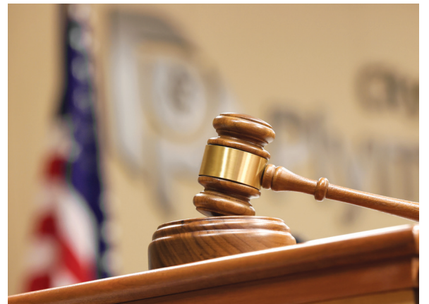
Three new Plymouth City Council members and the reelected mayor begin four-year terms in January.