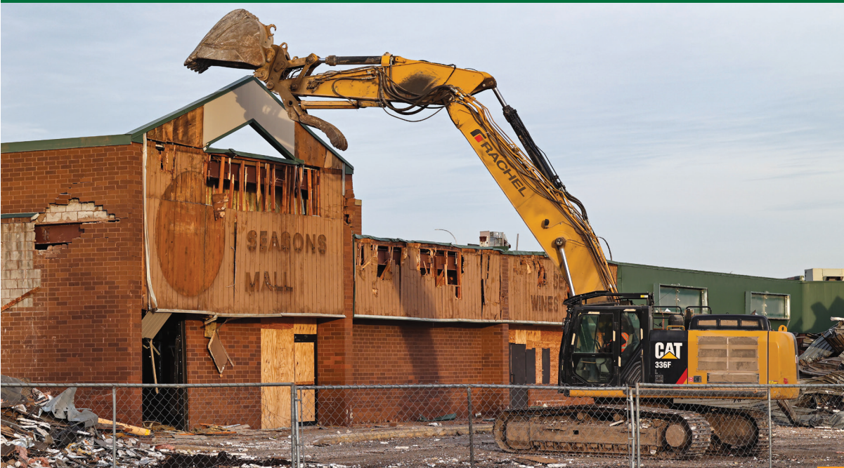
Demolition work began in November at the Four Seasons Mall site. The process started with asbestos abatement, and building and parking lot removal is expected to be complete in January. For more information, visit plymouthmn.gov/fourseasons .