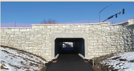
The new pedestrian underpass/tunnel at Peony Lane and Chankahda Trail will allow for safer crossings for pedestrians, students, bicyclists and more.

The reconstruction project began in spring 2022 and is set to be completed in three phases over multiple years, depending on funding. Looking Ahead to Phase 2 Approved in July 2022, the design for Phase 2 spans from Peony to Vicksburg lanes. Depending on funding, construction could begin in spring 2023 and would include rebuilding the roadway, installing concrete curb and gutter, making storm sewer improvements, and adding trails. Learn more about the project at plymouthmn.gov/chankahda .