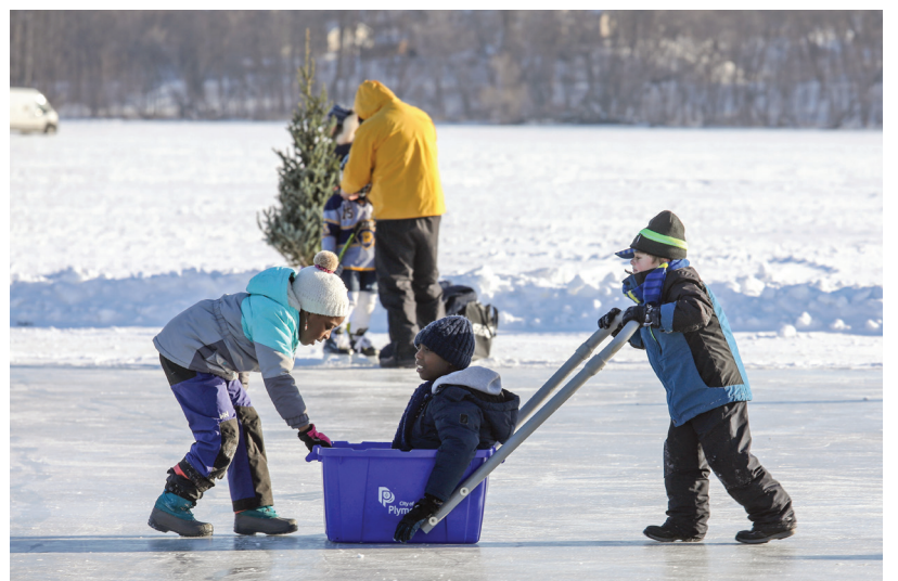
Fire & Ice returns to Parkers Lake Saturday, Feb. 4. The annual winter festival features a variety of outdoor activities, games, food trucks, fireworks and more.

The 13th-annual Fire & Ice Medallion Hunt begins Thursday, Jan. 5 with a clue posted on the city's