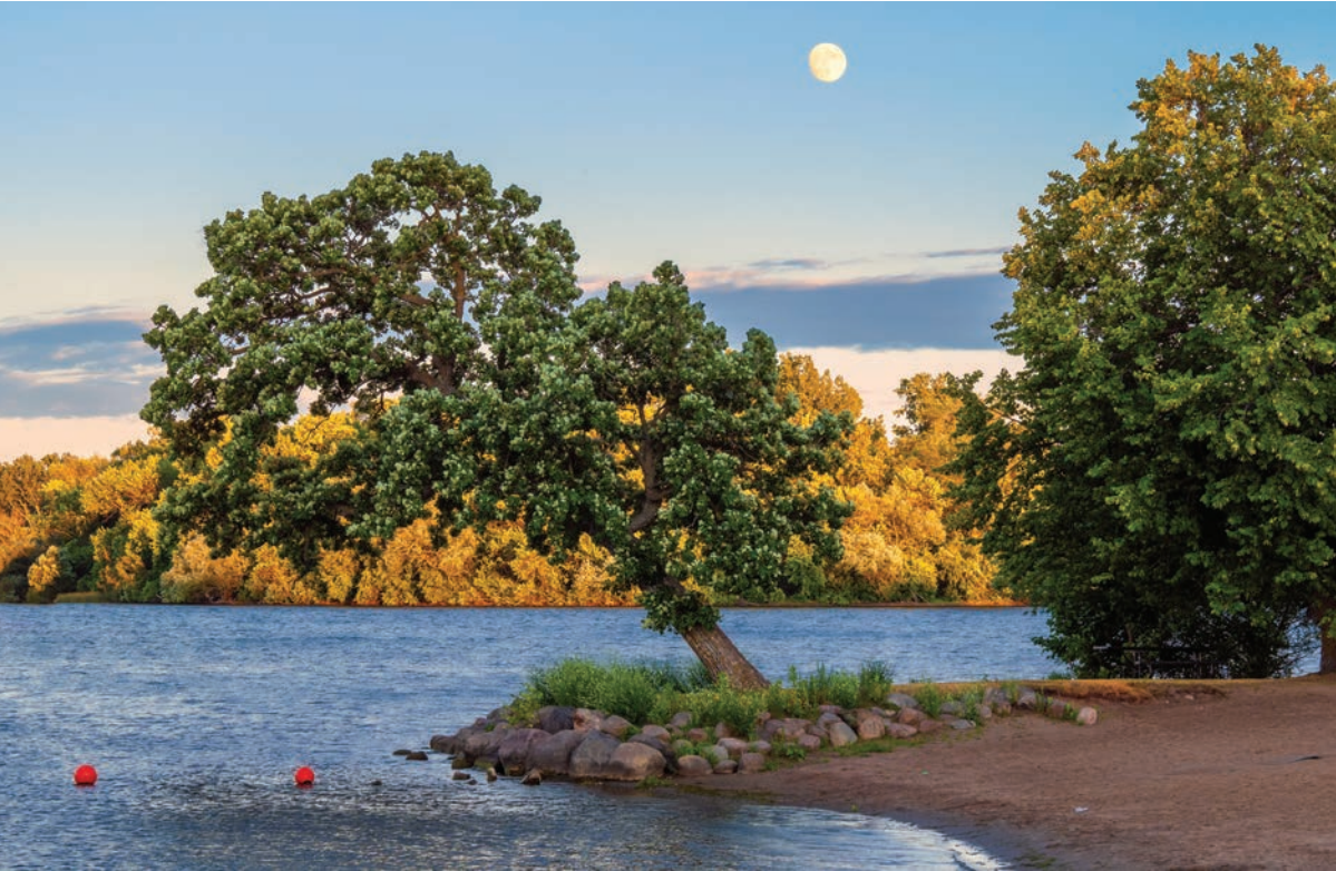
Overall Winner and City Landmarks – “Moonrise in West Medicine Lake Park” by Larry Paulson

Visit plymouthmn.gov/photocontest to view all winning photos. The contest is co-sponsored by the City of Plymouth and Plymouth Magazine.