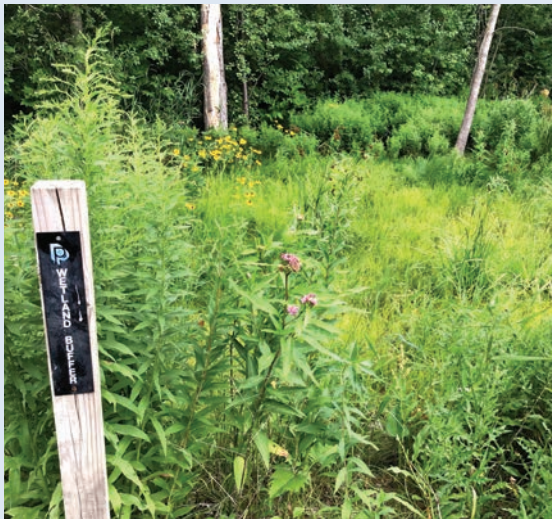
The city reminds residents that mowing, cutting, or cultivating plants within a wetland buffer is not allowed.

Mowing, cutting or cultivating plants within a wetland buffer is not allowed. Yard waste, such as leaves, sticks and grass clippings should also be kept outside of the buffer. For more information about wetland buffers, visit plymouthmn.gov/wetlands .