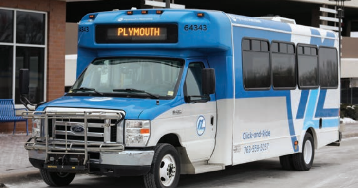
Plymouth Metrolink's Click-and-Ride now offers extended service to Maple Grove Transit Station. Click-and-Ride trips cost $3 each way.