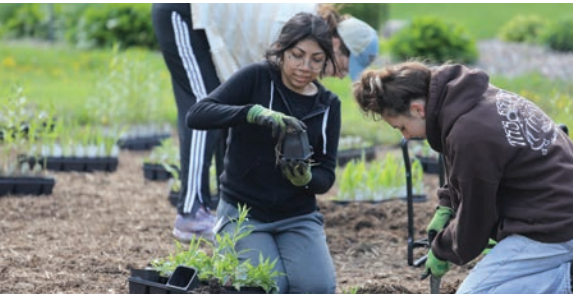
The City of Plymouth offers a wide variety of environmentally focused volunteer opportunities for all ages.

The survey was mailed to 2,800 randomly selected households in Plymouth in mid-August. Residents not part of the randomly selected group were invited to take the open-participation online survey. Survey results were presented at the Jan. 10 Plymouth City Council meeting. To view the NCS report, the City Council presentation and more, visit plymouthmn.gov/survey .