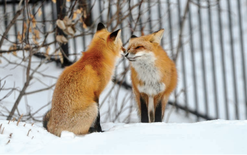
Wildlife & Nature and Readers' Choice (tie) – “Affectionate nose touch by this cute fox couple!” by Jan Speak