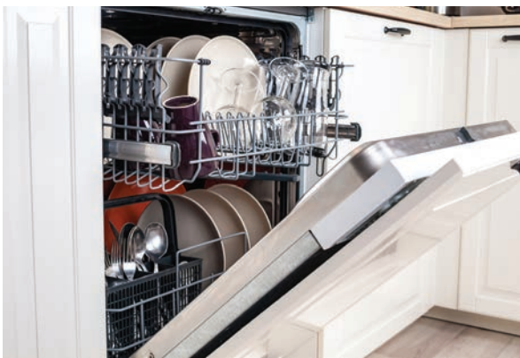
The Water Efficiency Rebate Program is available for select dishwashers, toilets, irrigation systems and washing machines.