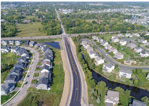
The Chankahda Trail (formerly County Road 47) Reconstruction Project is set to continue with the second phase this summer.

The timing of Phase 3 is dependent on funding. The city has requested $20 million in state bond funds to make the