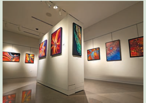
The city is seeking volunteers to serve as art ambassadors at the Plymouth Community Center.