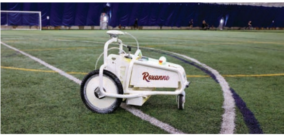
Roxanne the Painting Robot has assisted Parks & Forestry staff with field lining since spring of 2020.