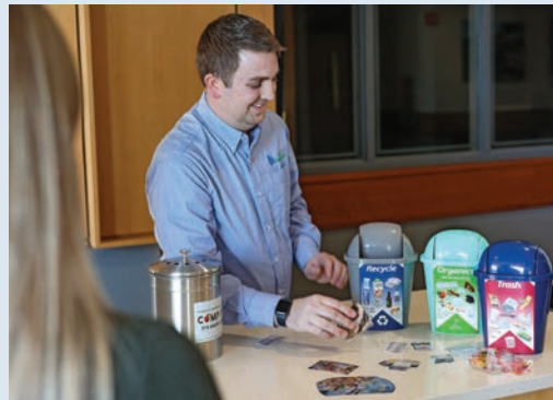
Residents may sign up for the 2023 Plymouth Environmental Academy, held August-November.