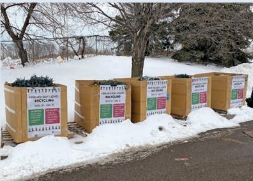
Plymouth's holiday light recycling initiative gathered nearly 4,000 pounds of holiday lights.

The Plymouth Environmental Academy is free and open to everyone. To learn more and apply, visit plymouthmn.gov/environmentalacademy .