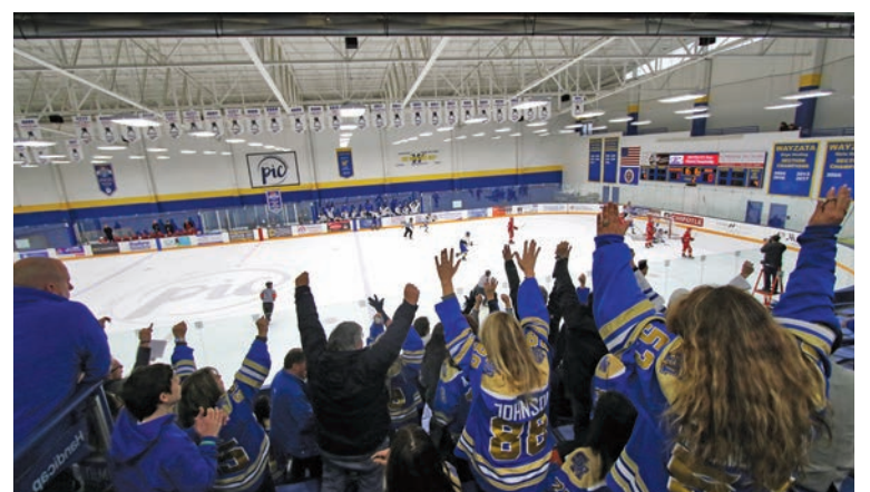
The Plymouth Ice Center will host nearly 50 teams from around the country for the 2023 Chipotle-USA Hockey High School National Championships in March.