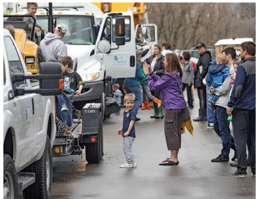
Discover Plymouth is set for Saturday, April 15 and includes a touch-a-truck exhibit, city information, nonprofit organizations, a marketplace for local goods and more.

Those interested in vendor or sponsorship opportunities must apply by Monday, March 27. For more information, visit plymouthmn.gov/discoverplymouth .