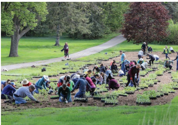
Residents can sign up for the Native Plant Garden Club to help care for native planting areas throughout the city.

The nearly 3-acre area requires regular maintenance and watering as the native species get established. The city is developing several new rain gardens throughout the community, which require similar care.