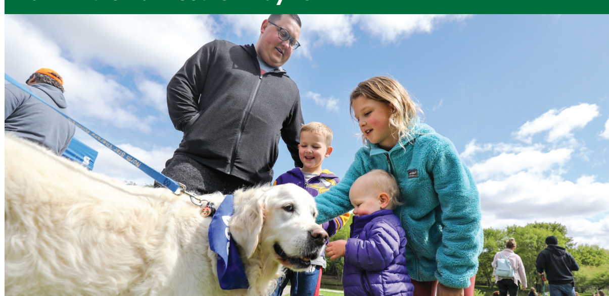
Update: Bark in the Park has been canceled

Bark in the Park is set for 9 a.m. to noon Saturday, May 20 at the Hilde Performance Center, 3500 Plymouth Blvd. The all-about-dogs event features activities, contests and vendors — and is free to attend. For more information, visit plymouthmn.gov/barkinthepark.