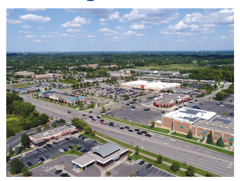
Included in the strategic themes is City Center 2.0, which is roughly defined as the geographic center of Plymouth, one mile west of Interstate 494 and Highway 55.

Consider the potential impact of development on all systems, especially transportation, public safety and parks.