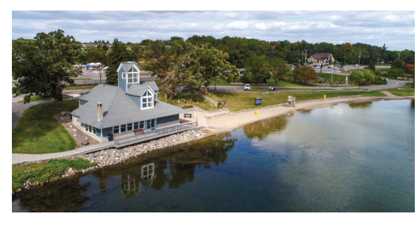
Parkers Lake Play Day is set for 6-8:30 p.m. Friday, June 23.

Beaches, Bands and Brews – 6-9 p.m. Friday, Aug. 11 at East Medicine Lake Park. Plymouth closes out the Summer Beach Series with the Beaches, Bands and Brews event featuring Minnesota-based band Sawyer's Dream. Food will be available for purchase.