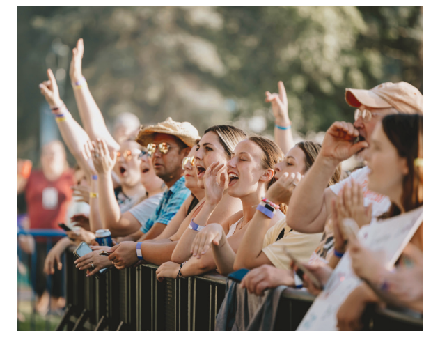
Live at the Hilde brings more outdoor concerts to Plymouth this summer.

Other artists may be announced closer to the events. For details and to purchase tickets, visit suemclean.com/hilde.