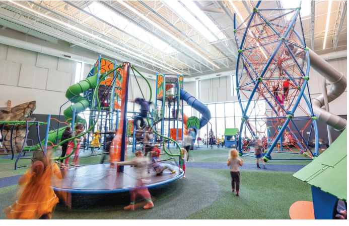
The Plymouth Parks and Recreation Department will hold sensory-friendly activity nights at the Plymouth Community Center July 14 and Aug. 11.

To reduce overstimulation, both spaces will offer limited attendance, dimmed lights and no overhead music played on speakers. The gym will include Imagination Playground's Big Blue Blocks for creative play, dedicated sensory bins, tumbling equipment and sports equipment. Noise canceling headphones will also be available for use.