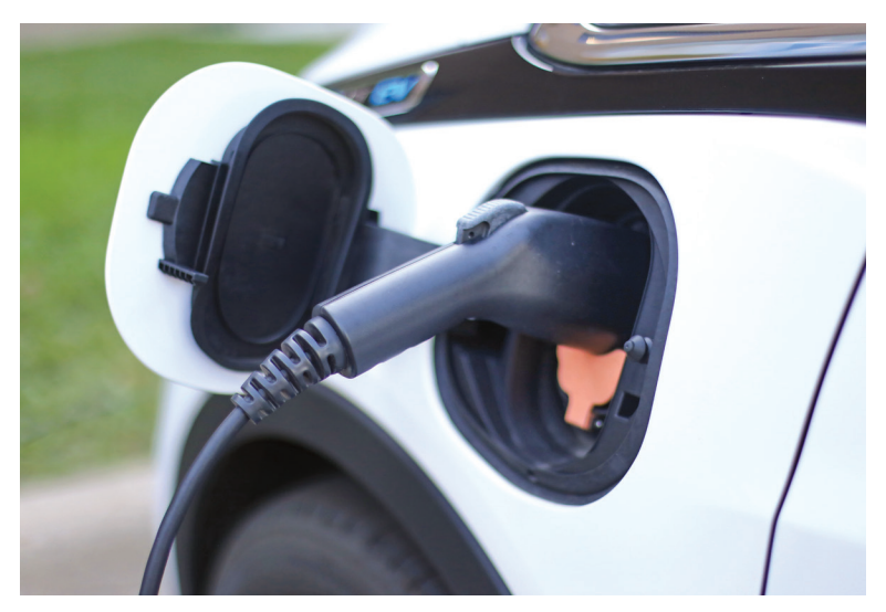
Once complete, the City of Plymouth will have a total of 115 electric vehicle charging stalls across 13 locations available for community use.

As part of the agreement, Carbon Solutions Group funds capital and operational costs for the EV charging stations at no cost to Plymouth taxpayers. Users pay a fee to