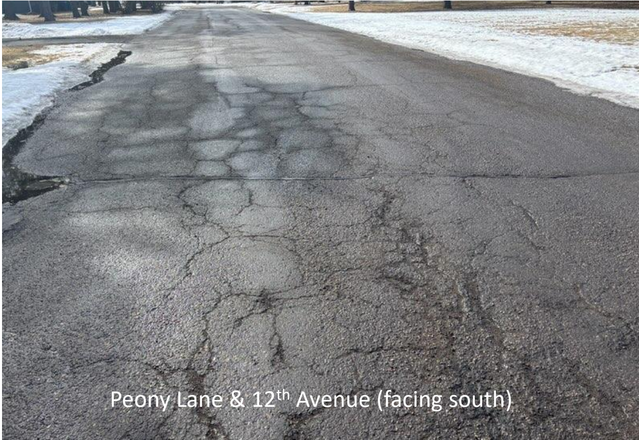
Peony Lane & 12 th Avenue (facing south)