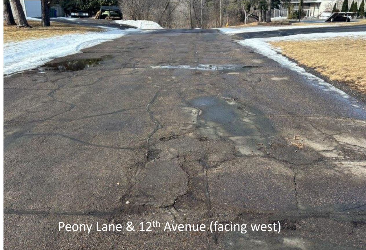
Peony Lane & 12 th Avenue (facing west)