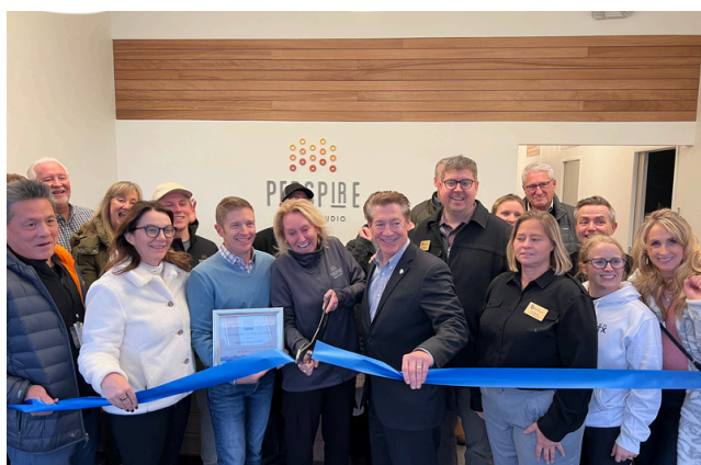
Perspire Sauna Studio

Tax, accounting, and consulting services provider, Copeland Buhl, relocated to Plymouth. Their new offices are located in the Atria Corporate Center.