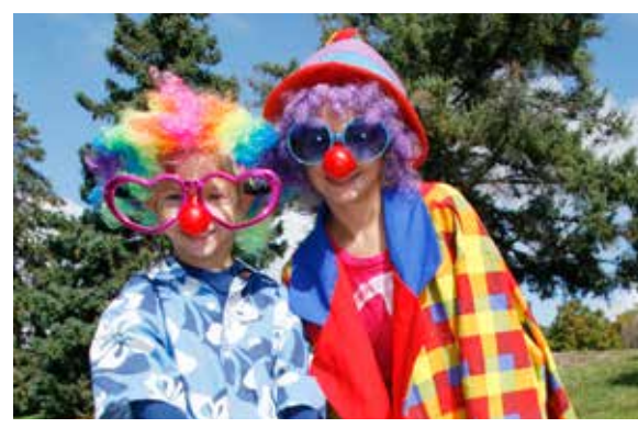
Clowns will tickle your funny bone at Plymouth on Parade. Post parade activities include music, swimming, skating and more.

Music, food, fun and marching bands will bring the community together again for the 15th annual Plymouth on Parade on Sat., Sept. 29, 11:30 a.m. Bring a chair or stand along the parade route to enjoy this perennial