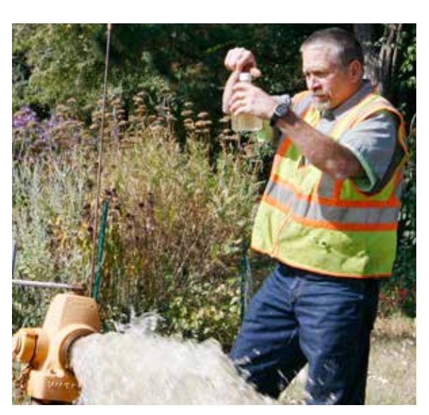
The city will not flush water mains this fall. Above, a city worker checks for iron during a past flushing.

Newberger also noted that the city's new water treatment facilities also contribute to better water. The new plants, along with seasoned operators, results in water that contains less iron when it is sent into the system. "The guys in the plants really have the new treatment systems dialed in. They are kind of competitive when it comes to which plant makes the best water," said Newberger.