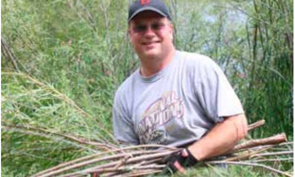
Volunteer groups help spruce up parks and open space.

Volunteers from the Plymouth Home Depot made sure the Parkers Lake Cemetary was in tip top shape for holidays.